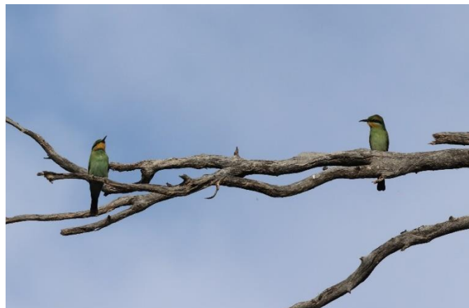
Photos: Rainbow bee-eater at floodplains.